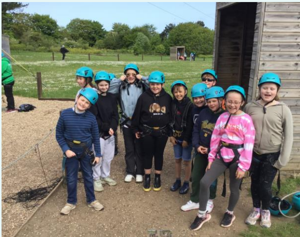
Getting ready to do a 'leap of faith'!