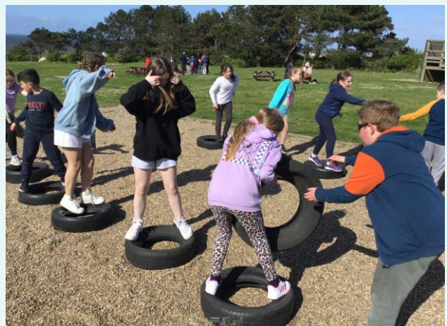
Problem solving task and team-work