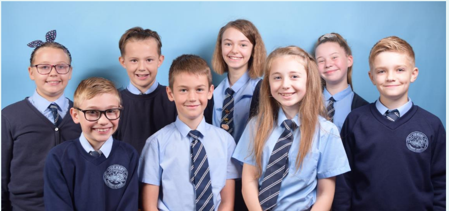
Hemsby Primary School House Captains 2023/2024